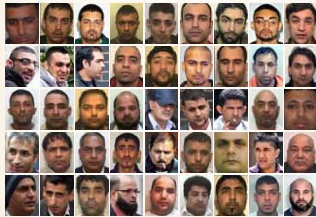
Convicted paedophiles from grooming gangs

↑ ↑ ↑ These are 'groomers' ...this is what they look like